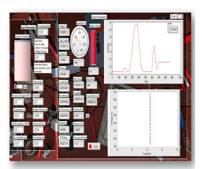
Fig.1. LabVIEW program result at STP

A LabVIEW program has been created that calculates the result. Using the conditions that are derived above at STP, a LabVIEW program result in comparison to that is